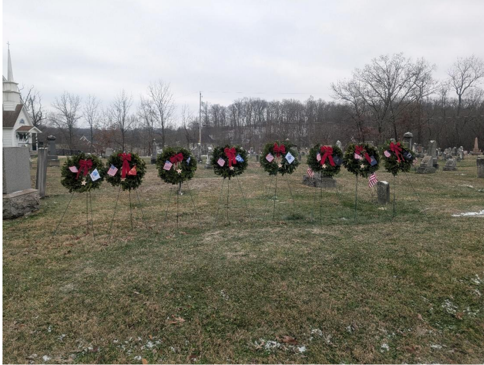
Wreaths for the different branches of services.