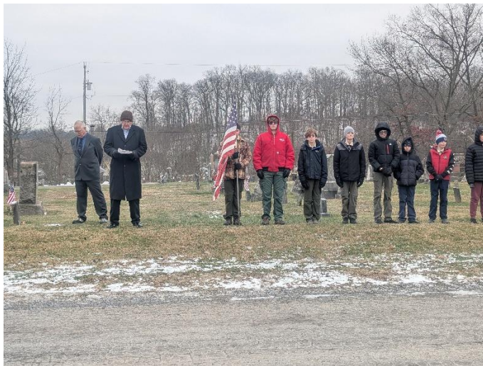
BOY SCOUT TROOP 403 Color Guard

Wreaths Across America Luncheon After the Wreaths Across America ceremony there was a Soup Luncheon in the Fellowship Hall.