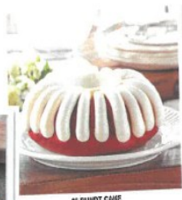
8" BUNDT CAKE