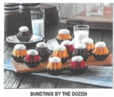
BUNDTINS BY THE DOZEN